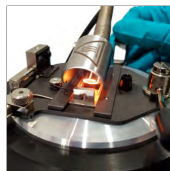
Dip the ignitor, flash detection is automatic