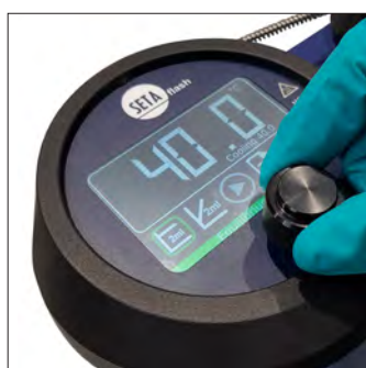
Select test temperature