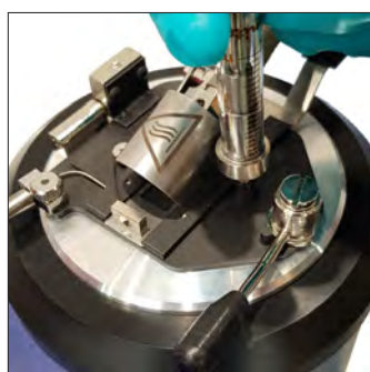
Inject 2ml sample